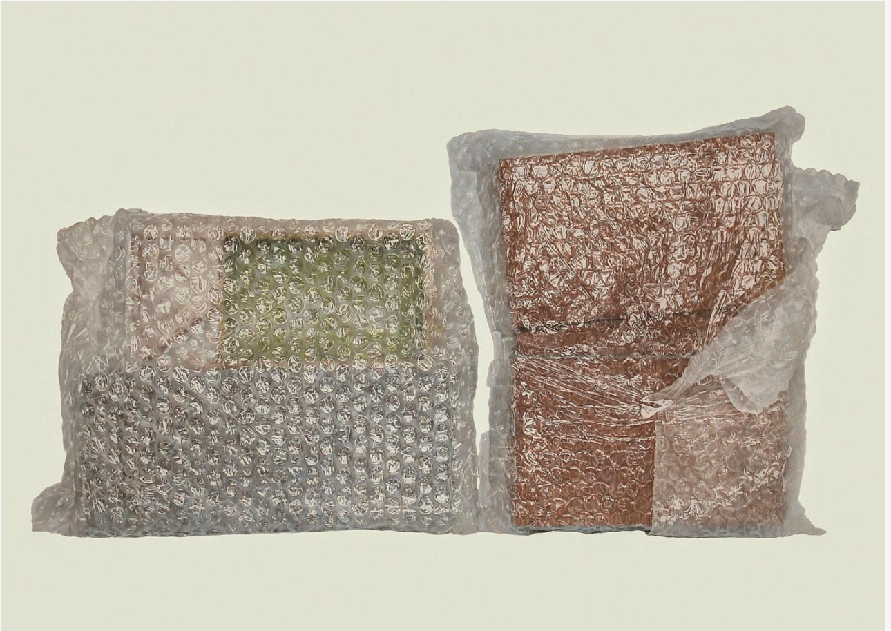
Ross Hansen: Models for Unrealised Ideas , 2014-15, colour pencil on paper